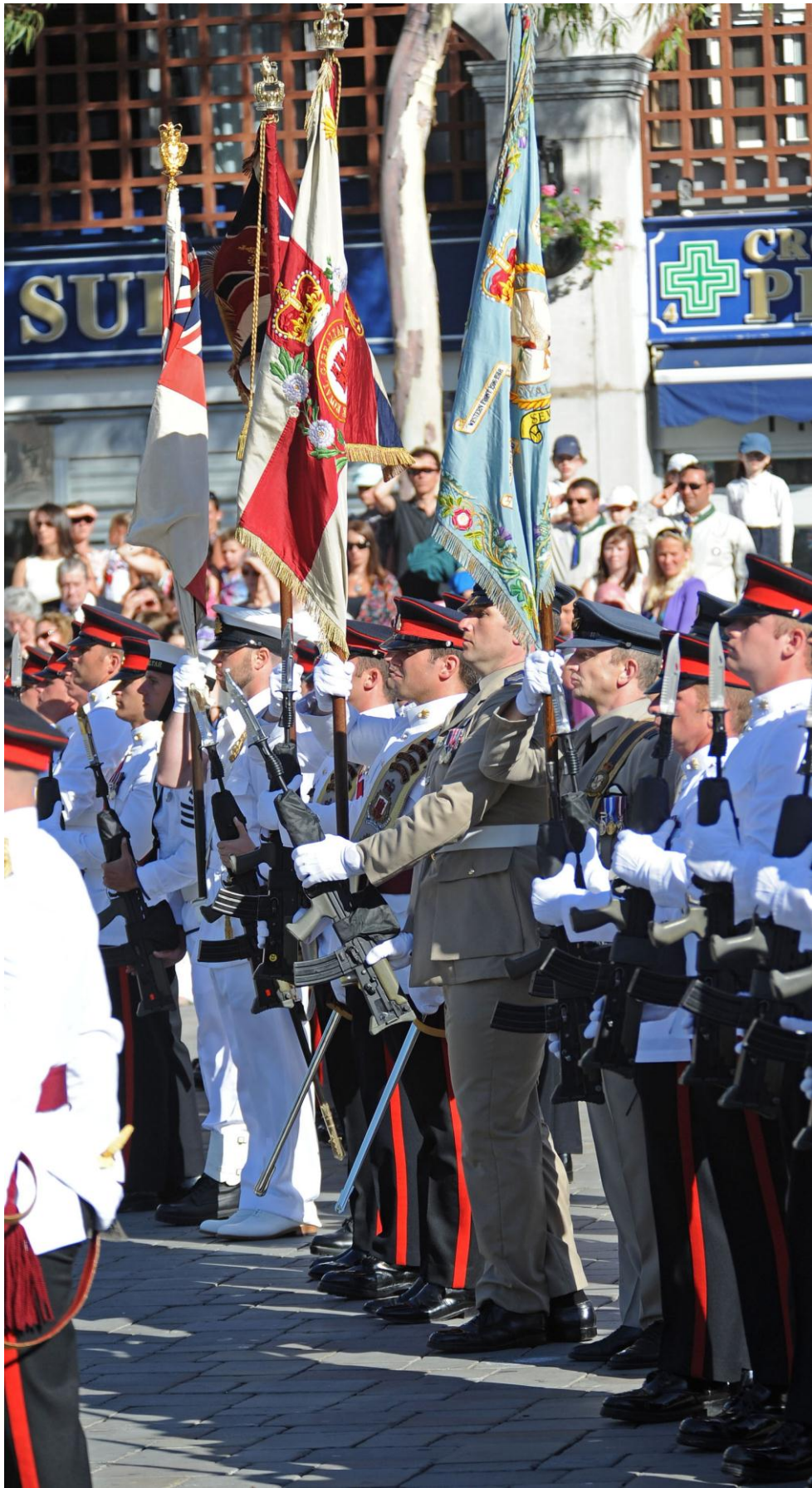
202 Squadron Standard on parade in Gibraltar, 11 th June 2012